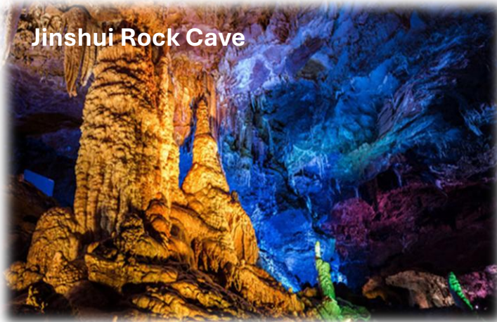
Jinshui Rock Cave