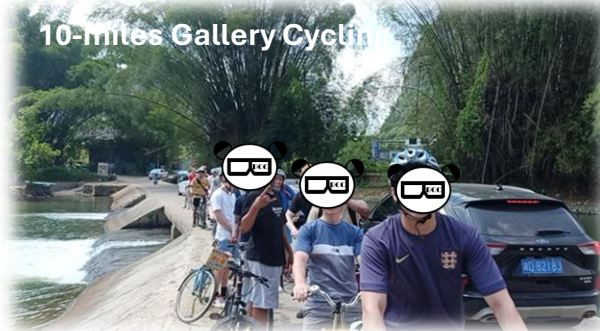
10-miles Gallery Cycling